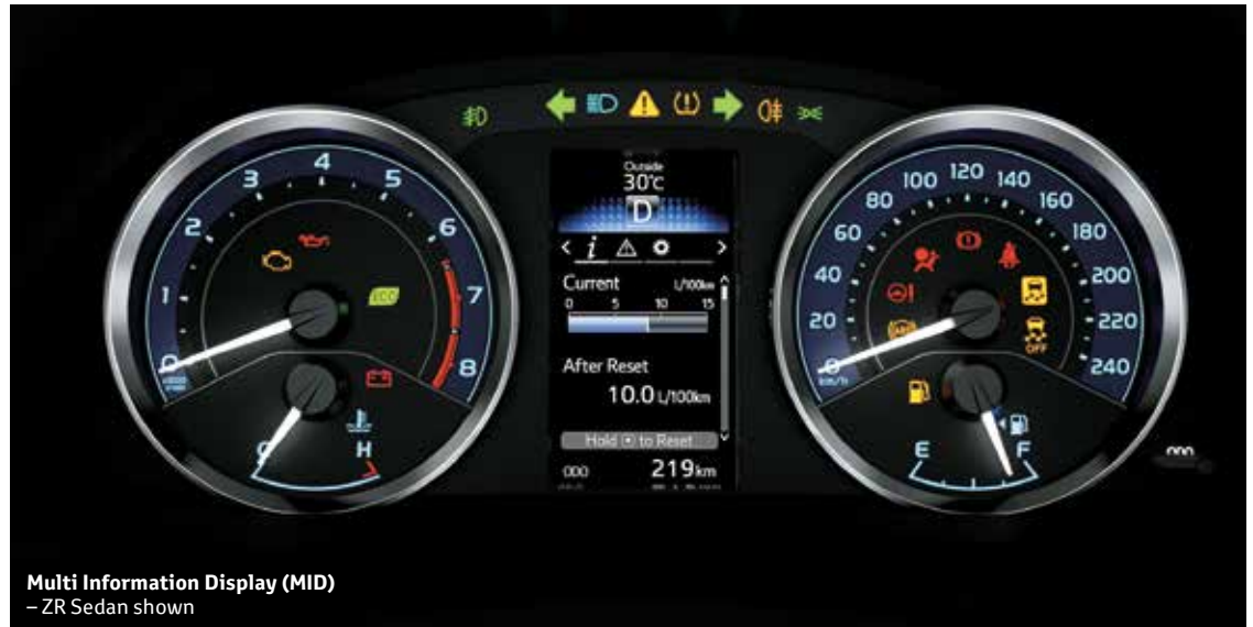
Multi Information Display (MID) – ZR Sedan shown

In Sedan ZR, you'll also have the one-touch steering wheel sequential shift paddles to bring the 7-speed Continuously Variable Transmission (CVT) to life.