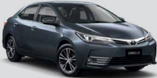
Moonlight 12 1F9