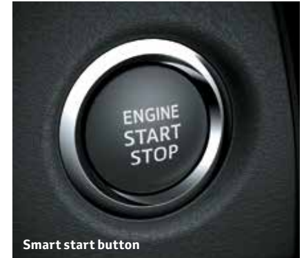
Smart start button