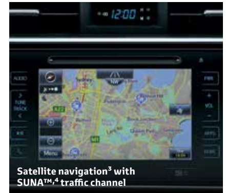
Satellite navigation 3 with SUNA™ 4 traffic channel