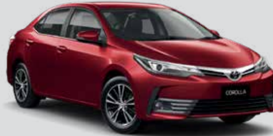
Wildfire 12 3R3