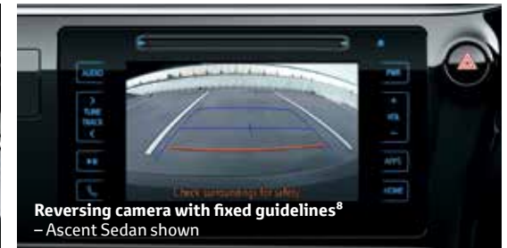
Reversing camera with fixed guidelines 8 – Ascent Sedan shown