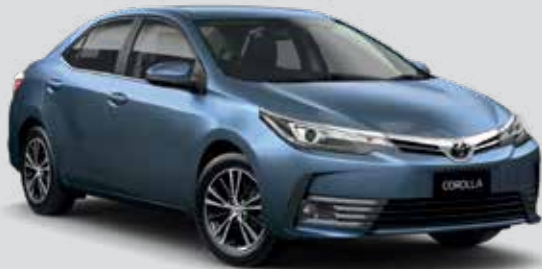
Blue Mist 12 8W1