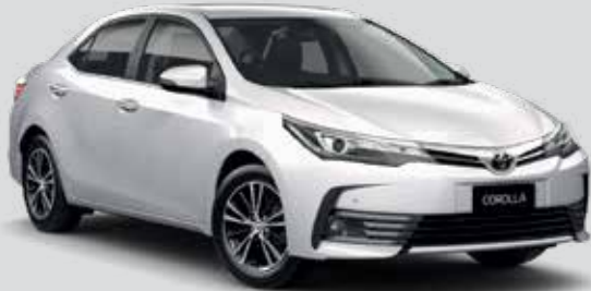
Glacier White 040