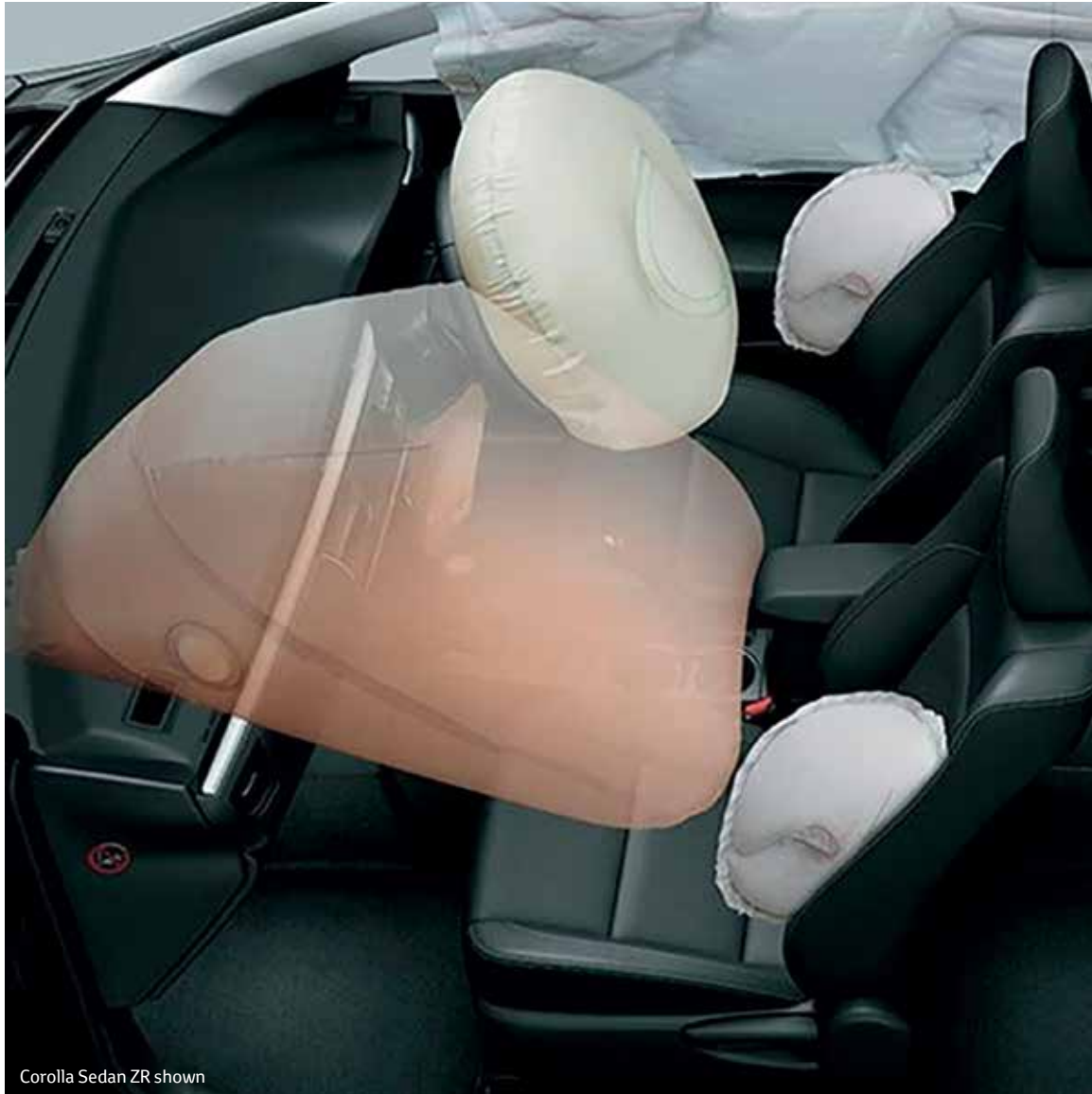
Corolla Sedan ZR shown