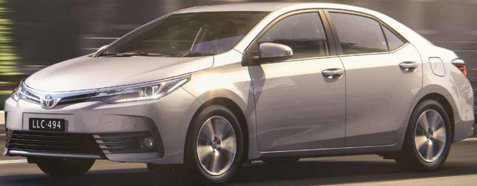
Silver Ash Corolla Sedan ZR shown

The raised engine hood and deeply sculptured bumper corners on Corolla Sedan create a strong 3-dimensional appearance. The wide grille combines with the headlamps and trapezoid bumper structure to express movement while always presenting a strong, solid stance on the road. On the ZR, the bi-LED headlamps will light the way on the darkest nights.