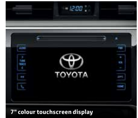
7" colour touchscreen display