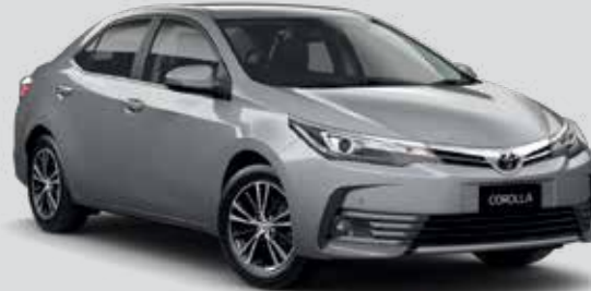
Silver Ash 12 1D4