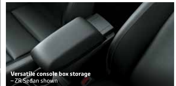
Versatile console box storage – ZR Sedan shown