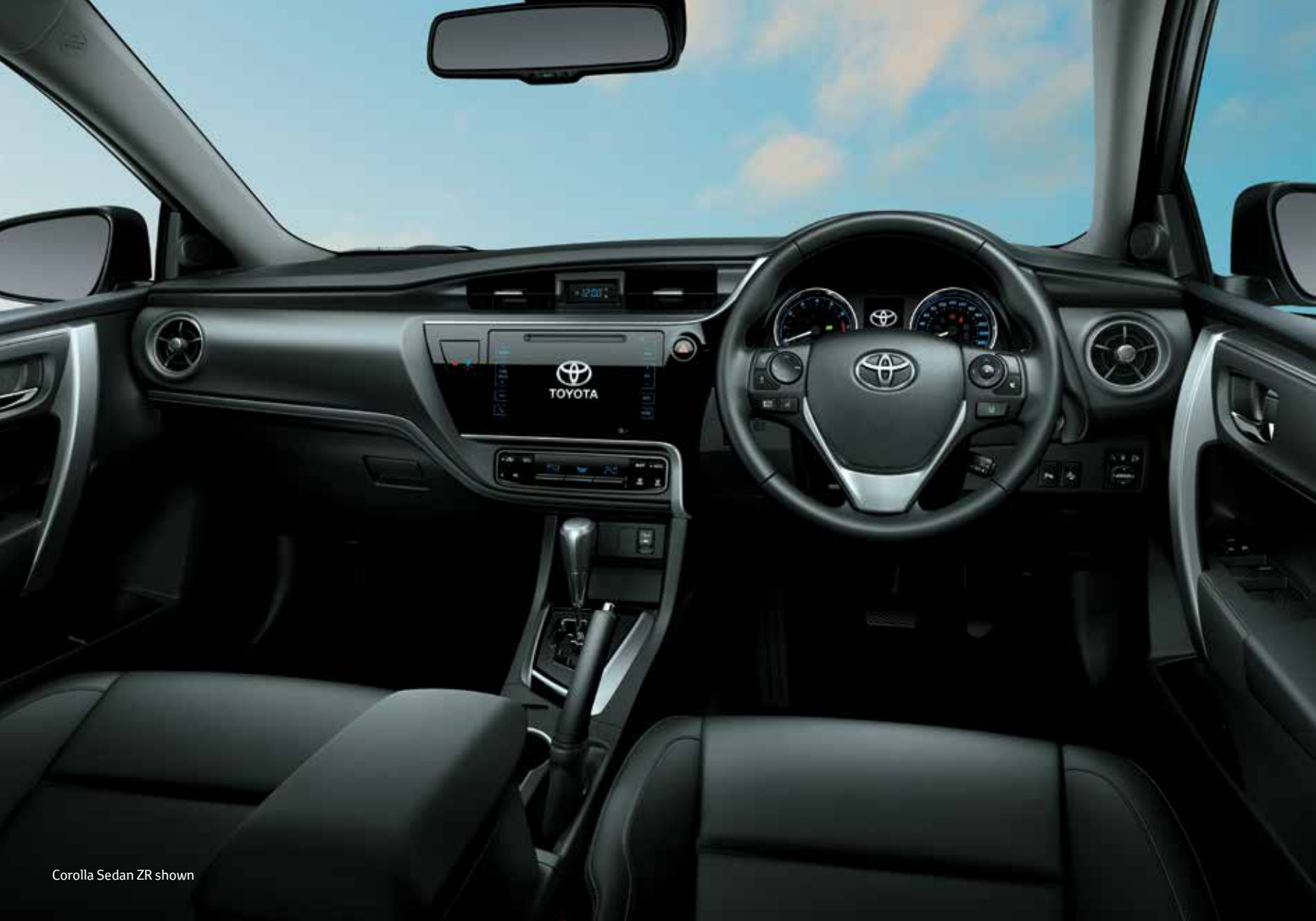
Corolla Sedan ZR shown