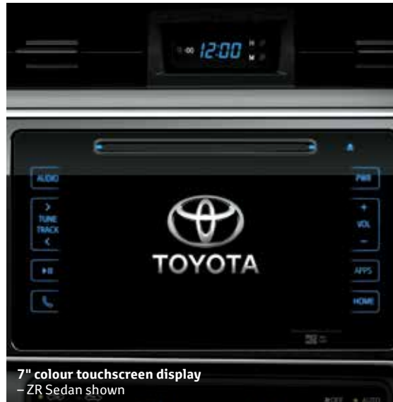
7" colour touchscreen display – ZR Sedan shown