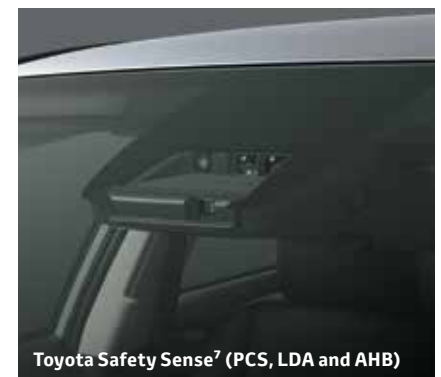
Toyota Safety Sense 7 (PCS, LDA and AHB)