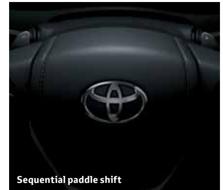
Sequential paddle shift