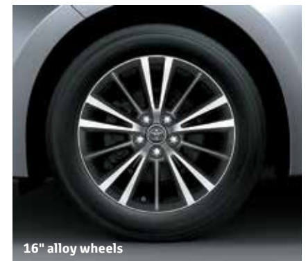
16" alloy wheels