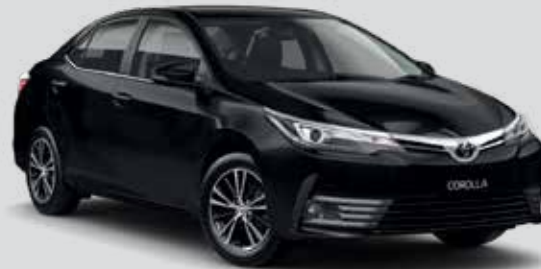
Eclipse Black 12 218