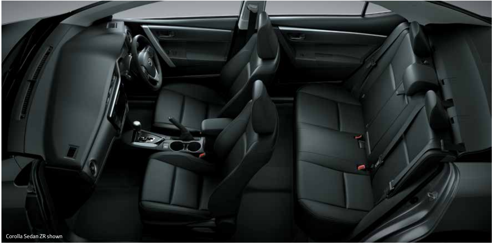
Corolla Sedan ZR shown