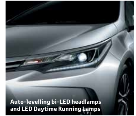
Auto-levelling bi-LED headlamps and LED Daytime Running Lamps