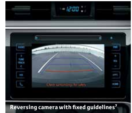
Reversing camera with fixed guidelines 7