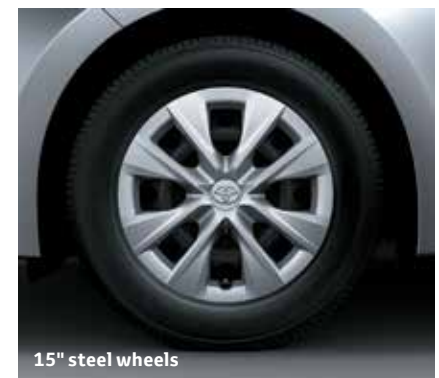
15" steel wheels